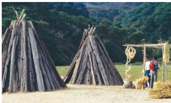
Reconstructed Miwok bark houses

For more than 5,000 years, the Coast Miwok lived in what is now Marin and Sonoma counties. Abundant food, a moderate climate and the closeness to the sea provided a comfortable life centered on the tasks of gathering food, hunting, and catching salmon and shellfish.