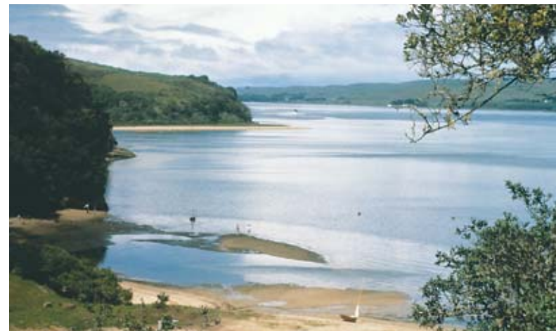
Overlook view from picnic area

Nature, time and the San Andreas Fault—directly beneath the 12-mile length of Tomales Bay—have had enormous impact on the land. Point Reyes Peninsula is separated from the continent by this great rift in the earth's crust. Its granite bedrock is unlike any of the nearby formations. The nearest granite on the east face of the fault matching that of Point Reyes Peninsula is in the Tehachapi