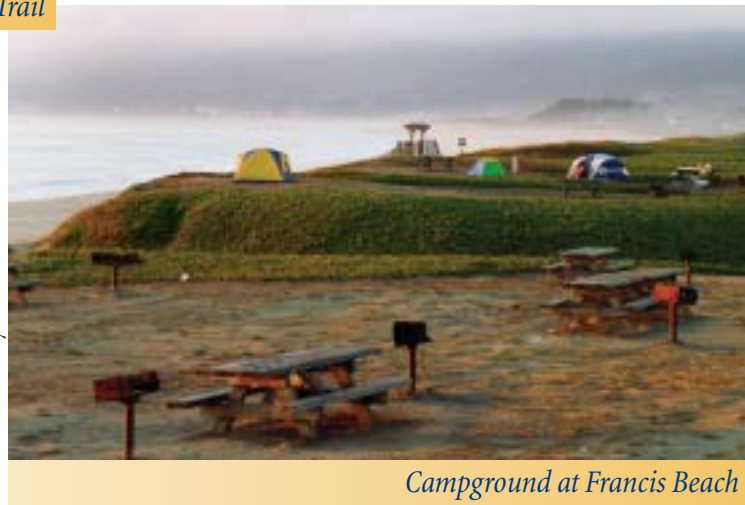
Campground at Francis Beach

Surfing conditions here are nearly impossible to forecast because of the unpredictable weather and surf action. However, depending on the direction of swell and the level of