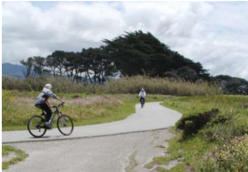
Bikers on the Coastside Trail near Dunes Beach

Also linguistically referred to as Coastanoans (a name bestowed by the