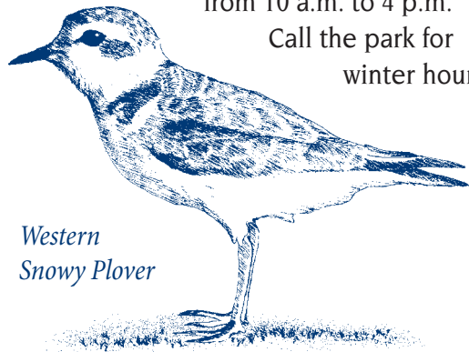
Western Snowy Plover