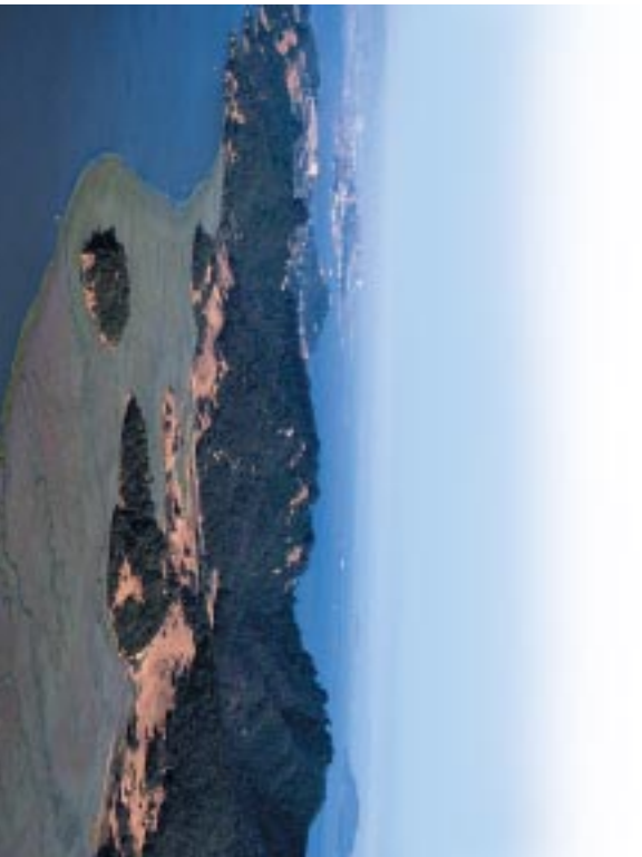
Aerial view of China Camp