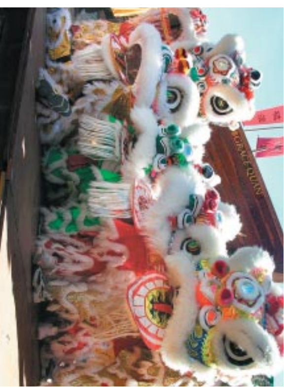
Lion dancers blessing the Chinese Junk Grace Quan on its launch day