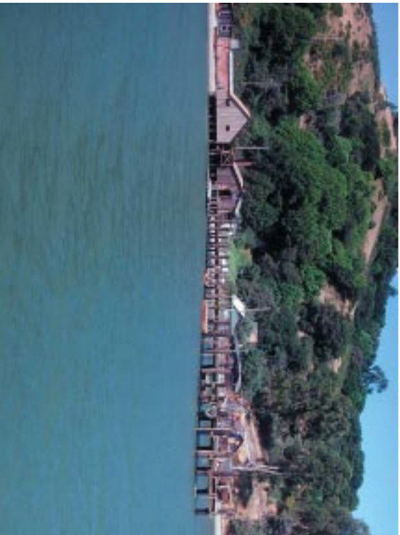
China Camp pier